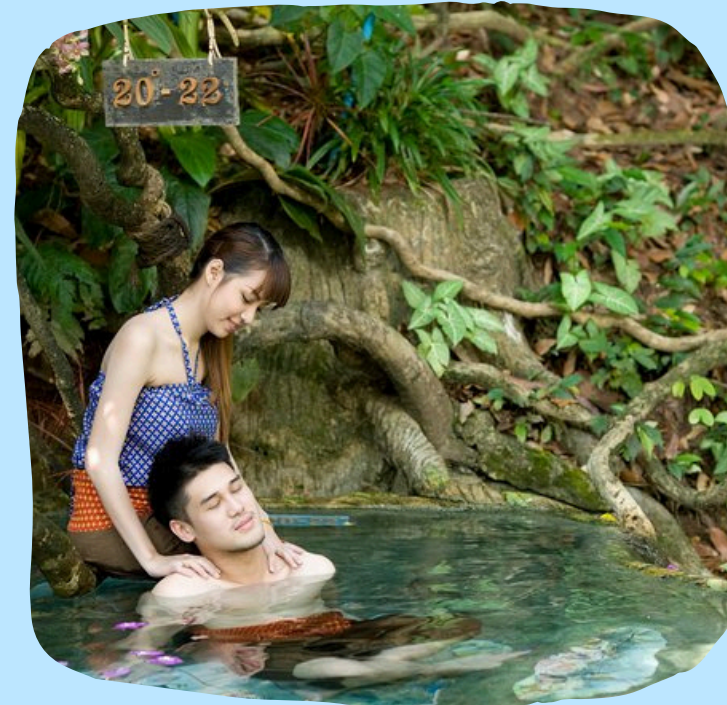
SPA / HOT SPRINGS