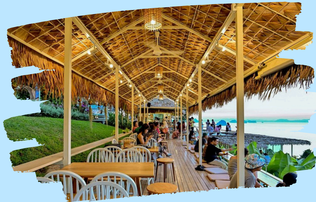
KHAOTHONG HILL CAFE