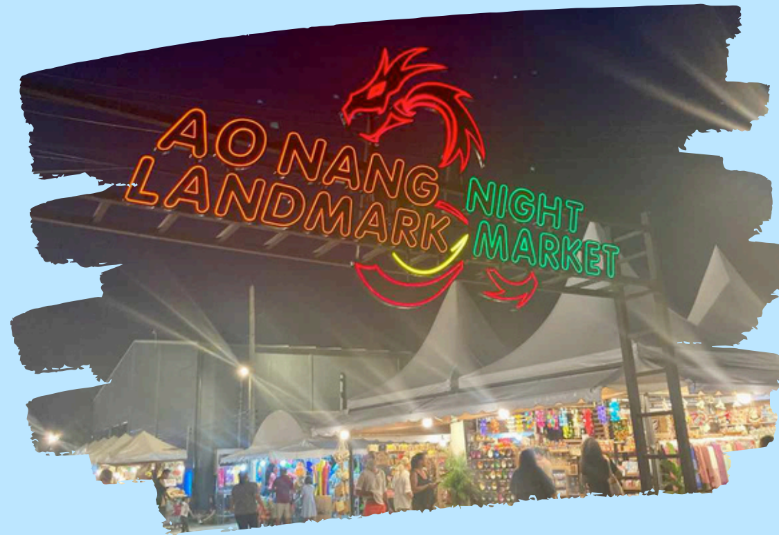
AO NANG NIGHT MARKET