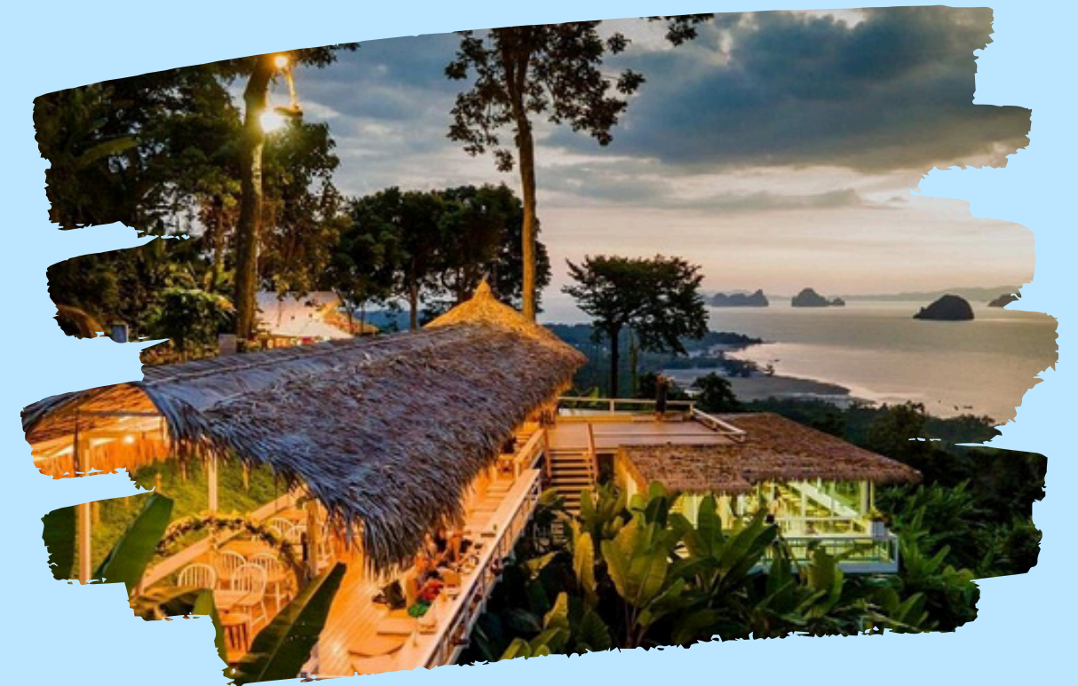
KHAOTHONG HILL CAFE