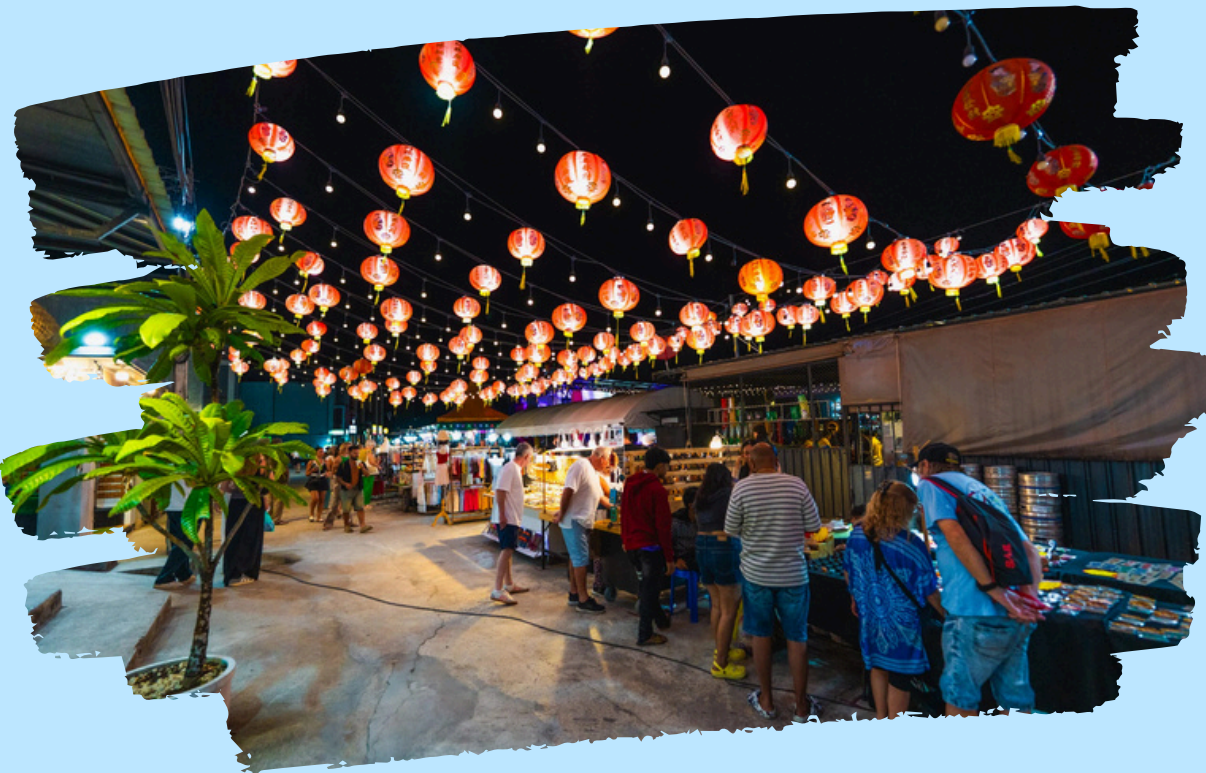
AO NANG NIGHT MARKET