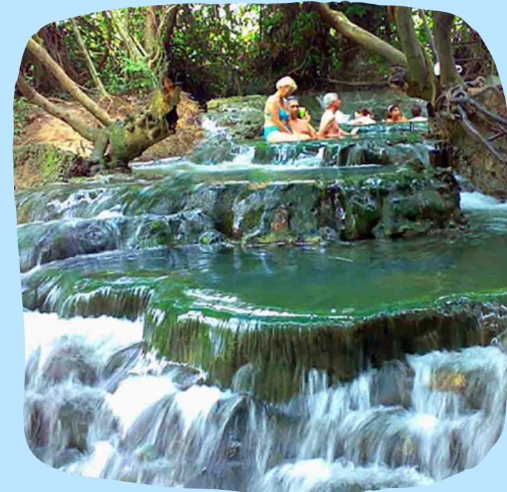
SPA / HOT SPRINGS